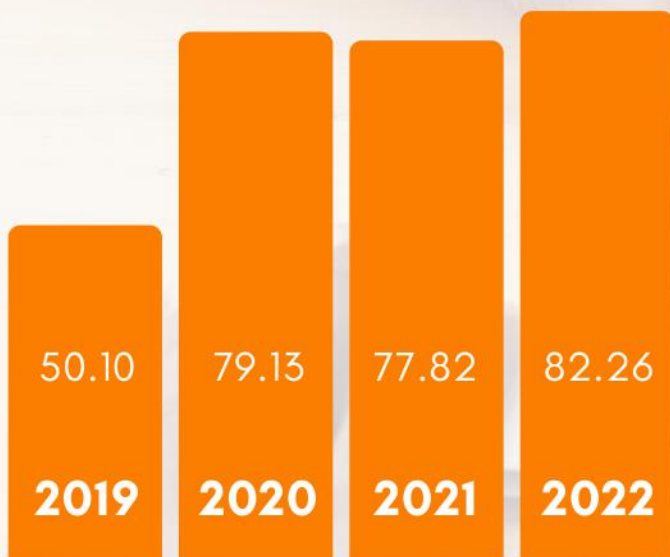
TOTAL ASSETS | Millions