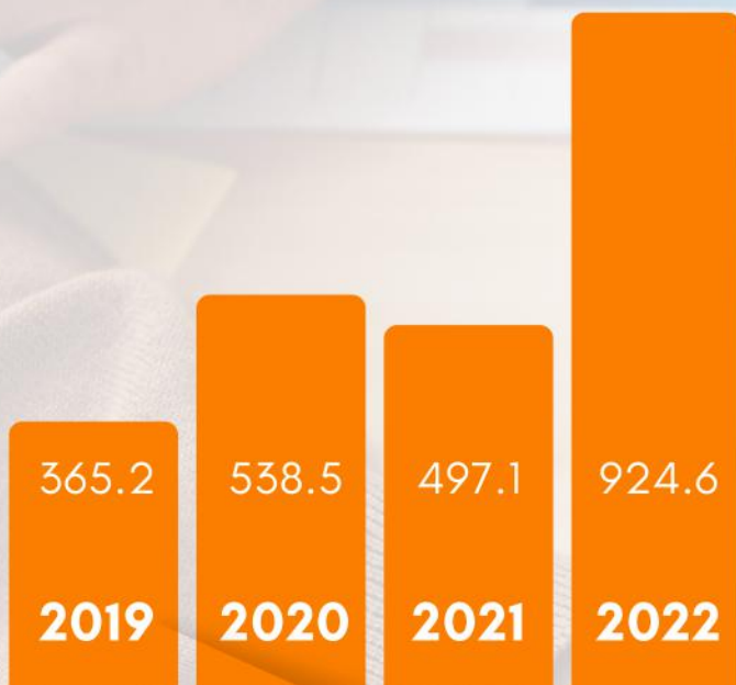
NET INCOME | Thousands