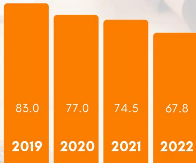
EFFICIENCY RATIO | Percentage