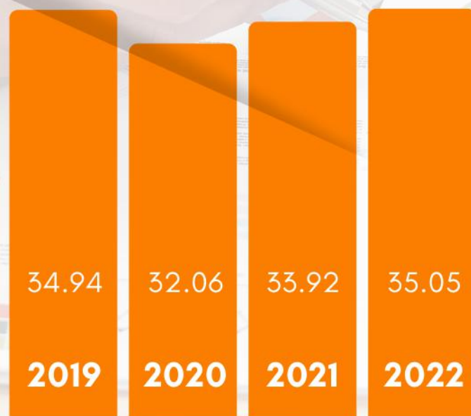
LOAN PORTFOLIO | Millions